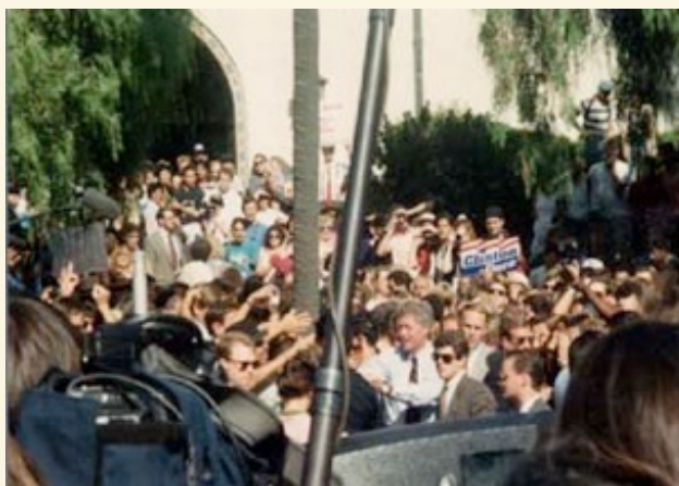
Presidential hopeful Bill Clinton, San Jose State University, 1991