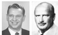
Sen. Hartke [D] Rep. Halpern [R]

1969 Senator Vance Hartke a Democrat of Indiana and Representative Seymour Halpern a Republican of New York both re-introduced bills to create a U.S. Department of Peace in the House of Representatives and the Senate. The 14 Senate co-sponsors of S. 953 " The Peace Act " included Birch Bayh (D-IN), Robert Byrd , (D-WV), Alan Cranston (D-CA), Daniel Inouye (D-HI) and Edmund Muskie (D-ME). The 67 House co-sponsors included Ed Koch [D] of New York, Donald Fraser [D] of Minnesota, and Abner Mikva [D] of Illinois, as well as Republican Paul McCloskey [R] of California.